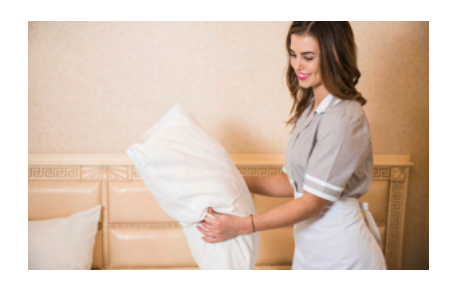
Housekeeping Housekeeping Service Essentials